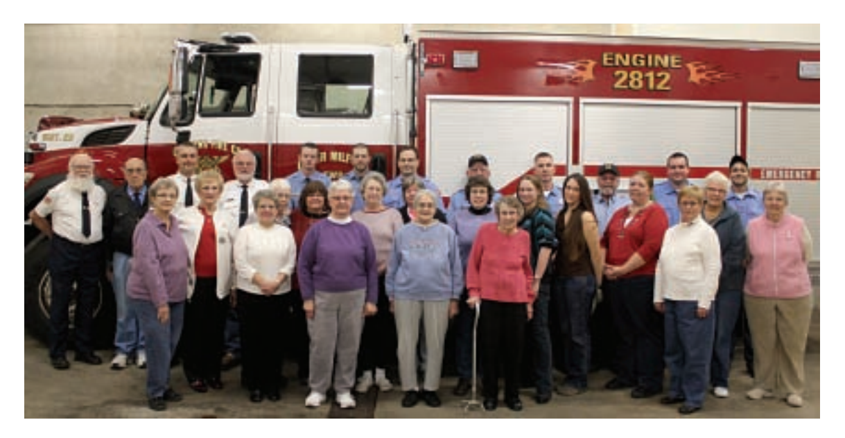
THANK YOU FOR YOUR CONTINUED SUPPORT OF OUR PROUD FIRE DEPARTMENTS

General Meeting – 1st Monday of every month at 8:00 PM • Fire Practice – Tuesday nights at 7 PM Ladies Auxiliary Meeting – Last Tuesday of the Month at 7:30 PM (Jan – Nov) in the Social Hall. See a member or e-mail VeraCruzLadiesAux@gmail.com for details or www.VCFD28.com / Ladies Aux Link Interested in renting the Social Hall? E-mail: HallRental@VCFD28.com for info or call (610)965-9444.