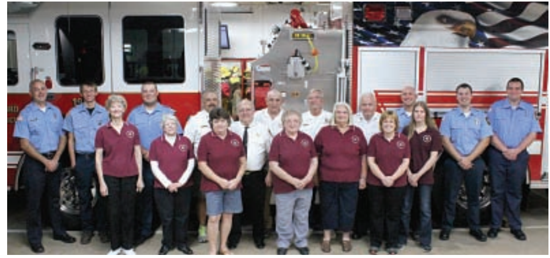
THANK YOU FOR YOUR CONTINUED SUPPORT OF OUR PROUD FIRE DEPARTMENTS

Chicken BBQ & Bake Sale: Date: Sunday, June 25, 2017 • Time: 11AM to 4PM • Price: $9 donation per ticket - Purchase tickets in advance!